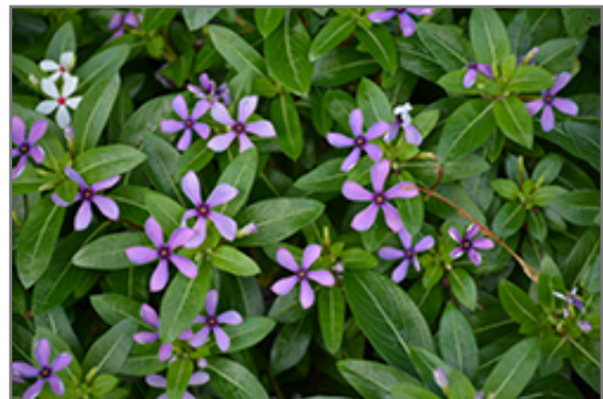
Soiree Kawaii Blueberry Kiss Vinca flowers