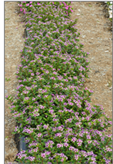
Soiree Kawaii Blueberry Kiss Vinca in bloom

Soiree Kawaii Blueberry Kiss Vinca will grow to be about 10 inches tall at maturity, with a spread of 18 inches. Its foliage tends to remain low and dense right to the ground. Although it's not a true annual, this fast-growing plant can be expected to behave as an annual in our climate if left outdoors over the winter, usually needing replacement the following year. As such, gardeners should take into consideration that it will perform differently than it would in its native habitat.