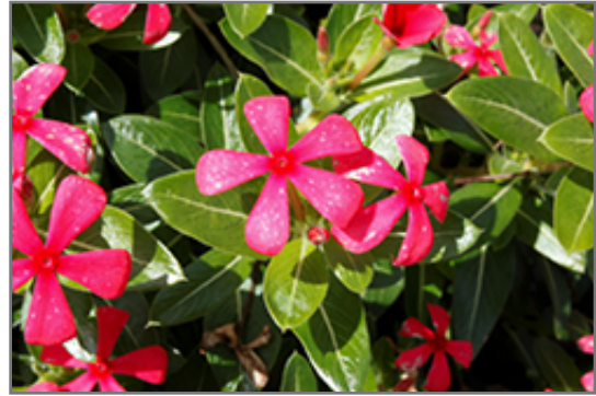
Soiree Kawaii Red Shades Vinca flowers

Soiree Kawaii Red Shades Vinca is a dense herbaceous annual with a trailing habit of growth, eventually spilling over the edges of hanging baskets and containers. Its medium texture blends into the garden, but can always be balanced by a couple of finer or coarser plants for an effective composition.