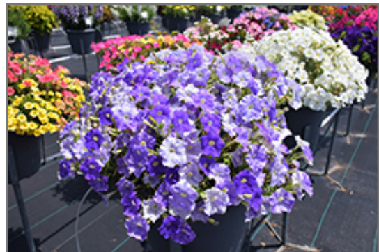
FlashForward Sky Blue Petunia in bloom