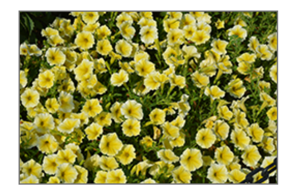
Bee's Knees Petunia flowers