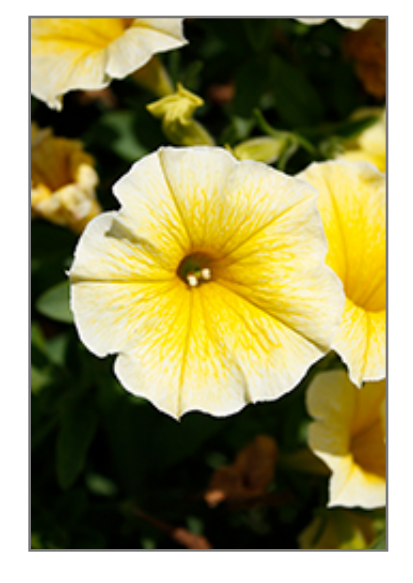
Bee's Knees Petunia flowers