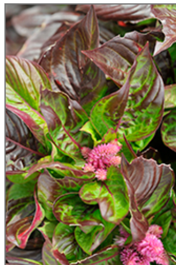
Sol Gekko Green Celosia flowers

Sol Gekko Green Celosia is recommended for the following landscape applications;