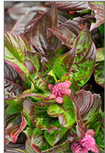
Sol Gekko Green Celosia flowers

Sol Gekko Green Celosia is recommended for the following landscape applications;