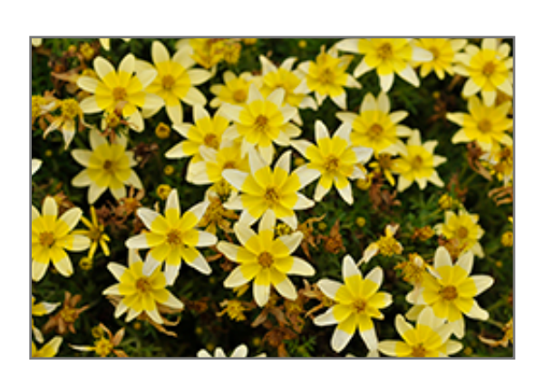
Taka Tuka White and Yellow Center flowers

This stunning selection showcases flowers with white tips and yellow centers; a well branched variety that is ideal for flower beds, large containers and hanging baskets; attracts pollinators; long blooming season