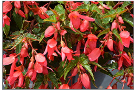
Groovy Rose Begonia flowers