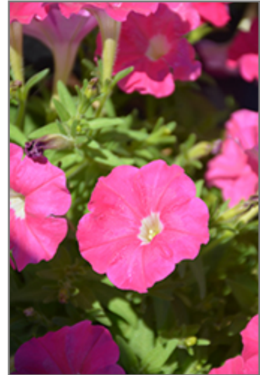
Picobella Pink Petunia flowers

Picobella Pink Petunia is recommended for the following landscape applications;