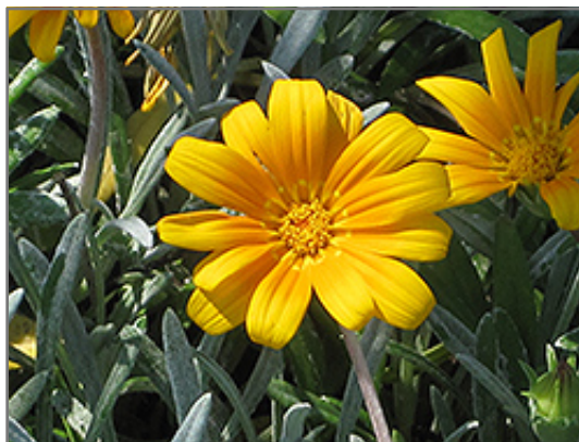
Orange Trailing Gazania flowers

Orange Trailing Gazania is recommended for the following landscape applications;