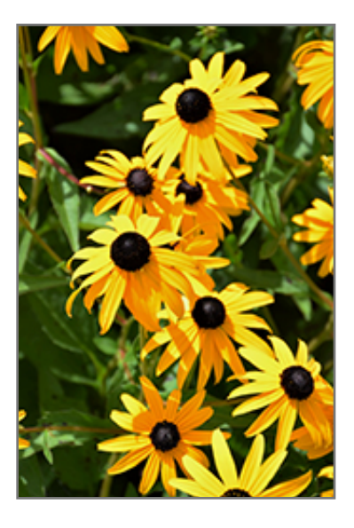
Goldsturm Coneflower flowers

Goldsturm Coneflower is recommended for the following landscape applications;