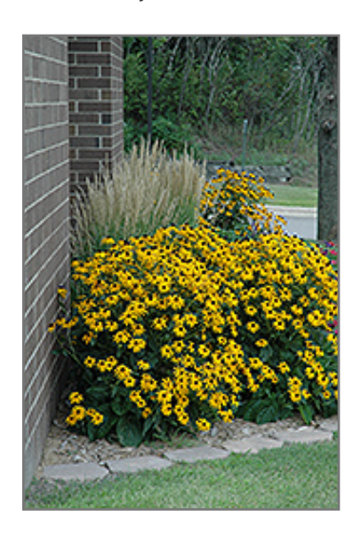
Goldsturm Coneflower in bloom