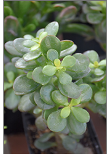
Baby Jade Plant foliage

This is a multi-stemmed evergreen houseplant with an upright spreading habit of growth. This plant can be pruned at any time to keep it looking its best.