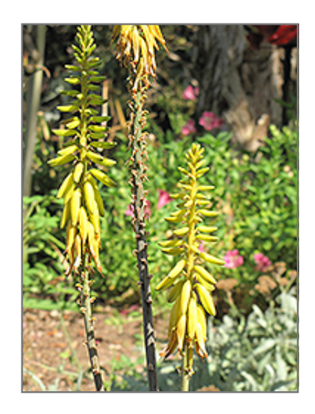
Aloe Vera Barbadensis flowers