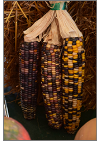
Wilma's Pride Ornamental Corn fruit

This plant is typically grown in a designated vegetable garden. It does best in full sun to partial shade. It prefers to grow in average to moist conditions, and shouldn't be allowed to dry out. It may require supplemental watering during periods of drought or extended heat. It is not particular as to soil type or pH. It is somewhat tolerant of urban pollution. This is a selection of a native North American species.