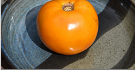
Golden Boy Tomato fruit

Landscape Services & Design Center 1190 W. Moana Lane Reno, NV 89509 (775) 825-0602 ext. 134 NV Lic. #3379A, D & CA Lic. #317448