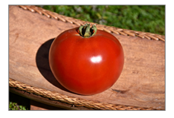
Red Bounty Tomato fruit