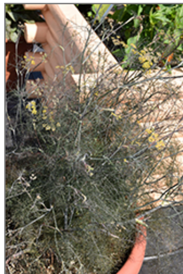
Licorice Towers Fennel