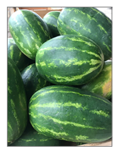
Sangria Watermelon fruit

Sangria Watermelon will grow to be about 18 inches tall at maturity, with a spread of 6 feet. When planted in rows, individual plants should be spaced approximately 3 feet apart. This vegetable plant is an annual, which means that it will grow for one season in your garden and then die after producing a crop.