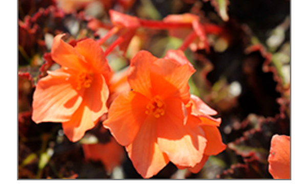
Cocoa Enchanted Sunrise Begonia flowers