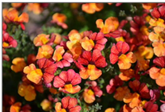
Babycakes Little Orange Nemesia flowers

Babycakes Little Orange Nemesia is recommended for the following landscape applications;