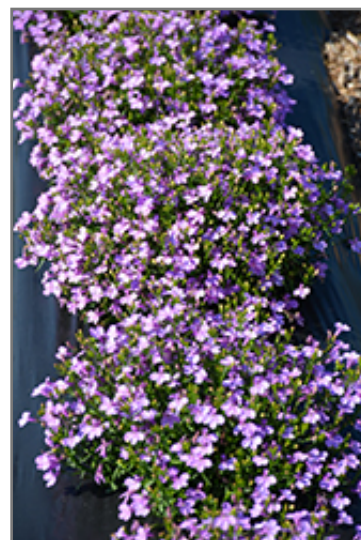
Lobelix Lilac Lobelia in bloom