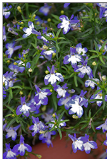
Lobelix Blue White Eye Lobelia flowers