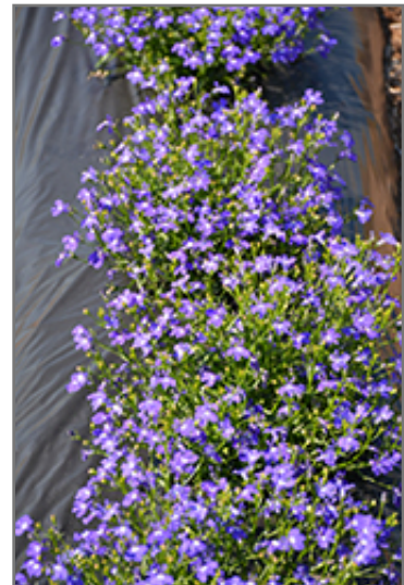
Lobelix Blue Lobelia in bloom