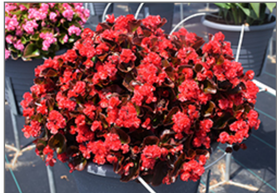
Double Up Red Begonia in bloom