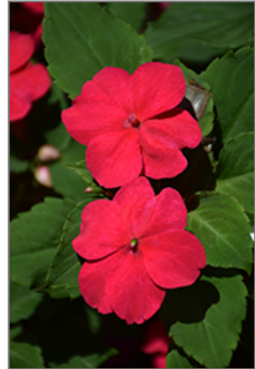
Imara XDR Rose Impatiens flowers

Imara XDR Rose Impatiens is recommended for the following landscape applications;