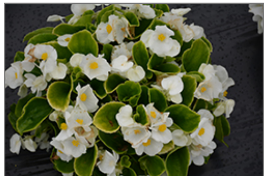
Sprint Plus White Begonia in bloom