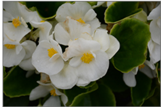
Sprint Plus White Begonia flowers

This is a high maintenance plant that will require regular care and upkeep, and usually looks its best without pruning, although it will tolerate pruning. Deer don't particularly care for this plant and will usually leave it alone in favor of tastier treats. Gardeners should be aware of the following characteristic(s) that may warrant special consideration;