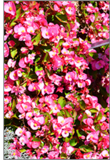
Sprint Plus Rose Begonia flowers

Sprint Plus Rose Begonia is a fine choice for the garden, but it is also a good selection for planting in outdoor containers and hanging baskets. It is often used as a 'filler' in the 'spiller-thriller-filler' container combination, providing a mass of flowers against which the thriller plants stand out. Note that when growing plants in outdoor containers and baskets, they may require more frequent waterings than they would in the yard or garden.