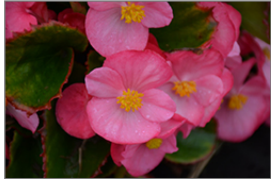
Sprint Plus Rose Begonia flowers

This is a high maintenance plant that will require regular care and upkeep, and usually looks its best without pruning, although it will tolerate pruning. Deer don't particularly care for this plant and will usually leave it alone in favor of tastier treats. Gardeners should be aware of the following characteristic(s) that may warrant special consideration;