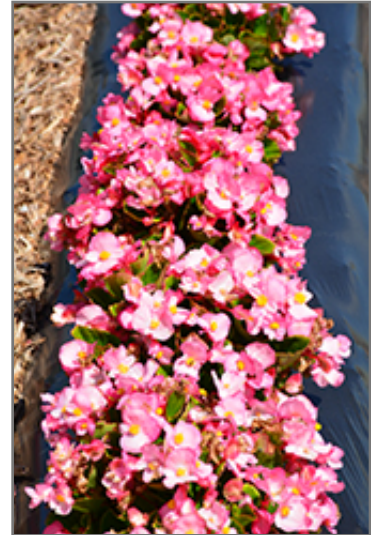
Sprint Plus Pink Begonia in bloom

Sprint Plus Pink Begonia is a fine choice for the garden, but it is also a good selection for planting in outdoor containers and hanging baskets. It is often used as a 'filler' in the 'spiller-thriller-filler' container combination, providing a mass of flowers against which the thriller plants stand out. Note that when growing plants in outdoor containers and baskets, they may require more frequent waterings than they would in the yard or garden.