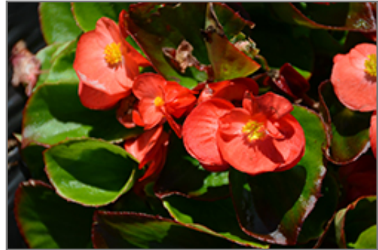
Sprint Plus Orange Begonia flowers