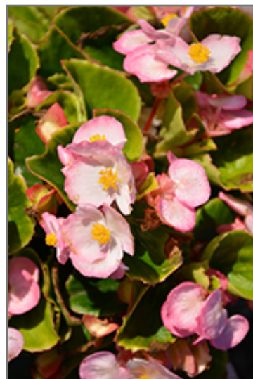
Sprint Plus Apple Blossom Begonia flowers

This is a high maintenance plant that will require regular care and upkeep, and usually looks its best without pruning, although it will tolerate pruning. Deer don't particularly care for this plant and will usually leave it alone in favor of tastier treats. Gardeners should be aware of the following characteristic(s) that may warrant special consideration;