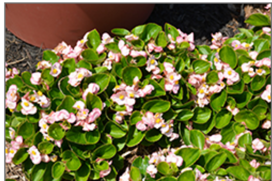
Sprint Plus Apple Blossom Begonia in bloom