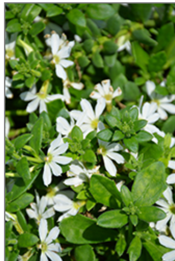
Scampi White Fan Flower flowers

Scampi White Fan Flower is recommended for the following landscape applications;