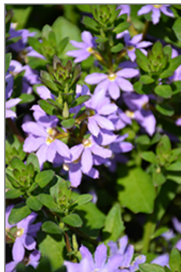
Scampi Blue Fan Flower flowers