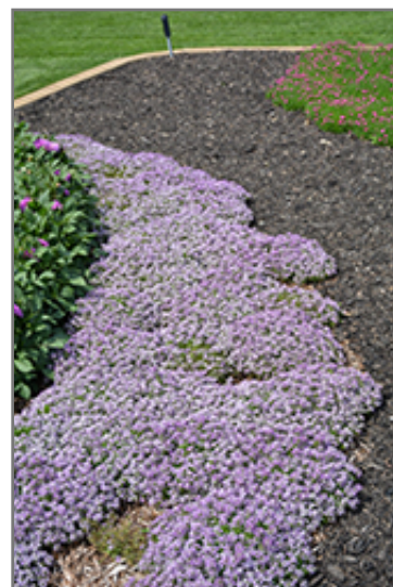
Yolo Lavender Sweet Alyssum in bloom