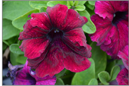
Success! HD Burgundy Petunia flowers

Success! HD Burgundy Petunia is recommended for the following landscape applications;