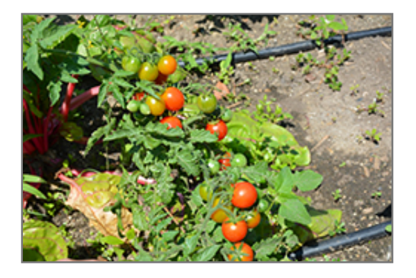
Homegrown Cherry Tomato fruit