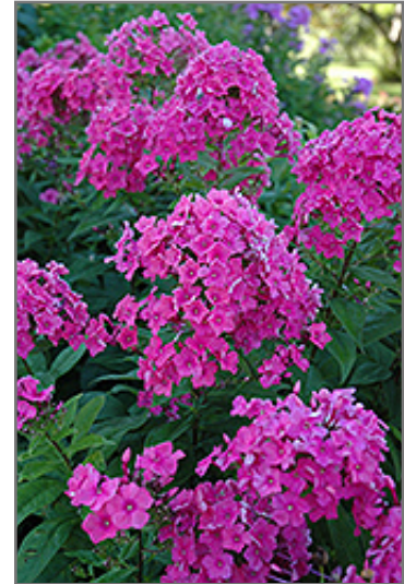
Eva Cullum Garden Phlox flowers

Eva Cullum Garden Phlox is recommended for the following landscape applications;