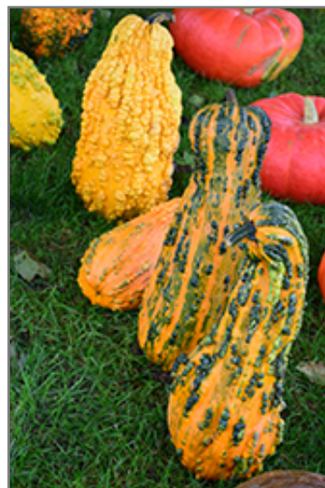
Lunch Lady Gourd fruit