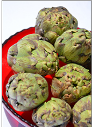
Colorado Red Star Artichoke fruit

11301 S. Virginia Street Reno, NV 89511 (775) 853-1319