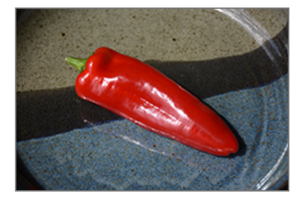
Sweet Sunset Pepper fruit

Landscape Services & Design Center 1190 W. Moana Lane Reno, NV 89509 (775) 825-0602 ext. 134 NV Lic. #3379A, D & CA Lic. #317448