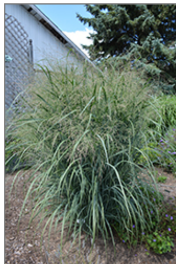
Northwind Switch Grass in bloom

This plant does best in full sun to partial shade. It is very adaptable to both dry and moist locations, and should do just fine under typical garden conditions. It is considered to be drought-tolerant, and thus makes an ideal choice for a low-water garden or xeriscape application. It is not particular as to soil type, but has a definite preference for alkaline soils, and is able to handle environmental salt. It is somewhat tolerant of urban pollution. This is a selection of a native North American species. It can be propagated by division; however, as a cultivated variety, be aware that it may be subject to certain restrictions or prohibitions on propagation.