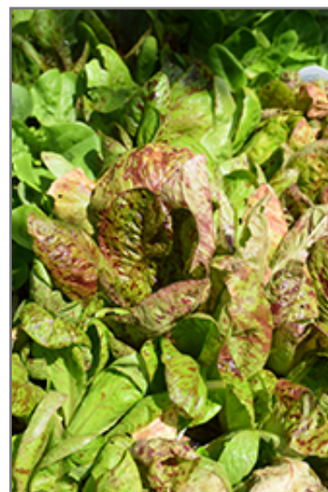
Freckles Romaine Lettuce foliage