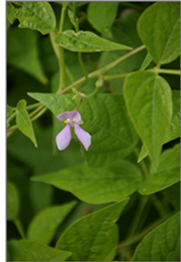
Golden Wax Bean flowers

Golden Wax Bean will grow to be about 10 feet tall at maturity, with a spread of 24 inches. When planted in rows, individual plants should be spaced approximately 12 inches apart. Because of its vigorous growth habit, it may require staking or supplemental support. This fast-growing vegetable plant is an annual, which means that it will grow for one season in your garden and then die after producing a crop. Because of its relatively short time to maturity, it lends itself to a series of successive plantings each staggered by a week or two; this will prolong the effective harvest period.