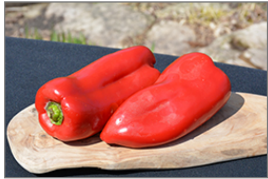
Gypsy Sweet Pepper fruit