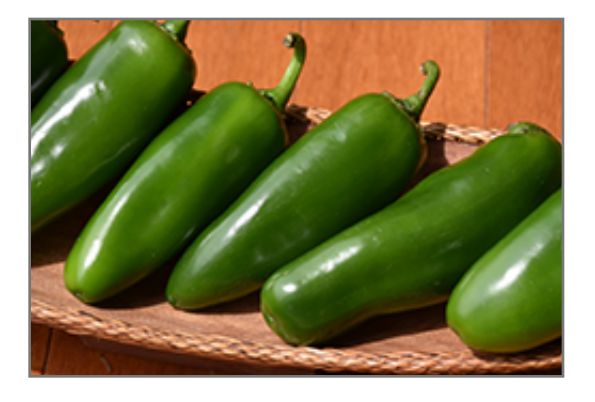
Jalafuego Hot Pepper fruit

Landscape Services & Design Center 1190 W. Moana Lane Reno, NV 89509 (775) 825-0602 ext. 134 NV Lic. #3379A, D & CA Lic. #317448