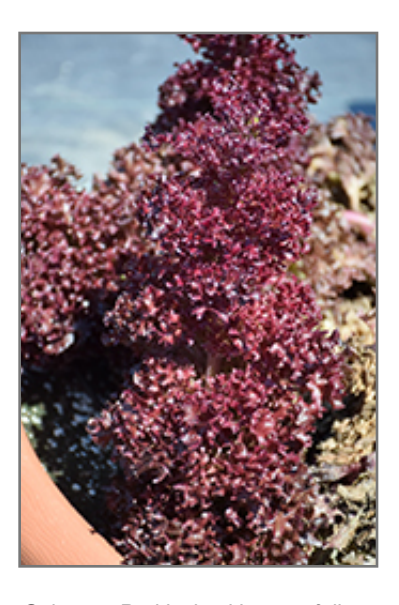
Salanova Red Incised Lettuce foliage

This plant is typically grown in a designated vegetable garden. It does best in full sun to partial shade. It does best in average conditions that are neither too wet nor too dry, and is very intolerant of standing water. It may require supplemental watering during periods of drought or extended heat. It is not particular as to soil pH, but grows best in rich soils. It is quite intolerant of urban pollution, therefore inner city or urban streetside plantings are best avoided. This is a selected variety of a species not originally from North America.; however, as a cultivated variety, be aware that it may be subject to certain restrictions or prohibitions on propagation.