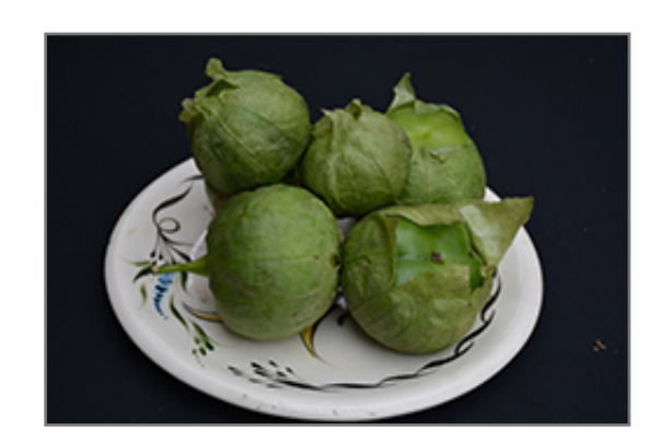
Tomatillo fruit