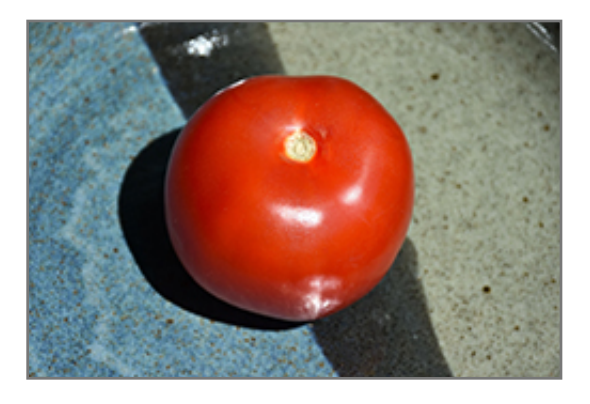
Amelia Tomato fruit

Landscape Services & Design Center 1190 W. Moana Lane Reno, NV 89509 (775) 825-0602 ext. 134 NV Lic. #3379A, D & CA Lic. #317448