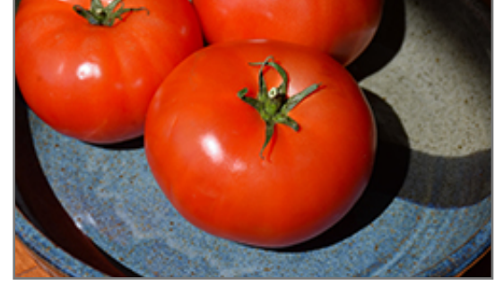
Beefy Boy Tomato fruit