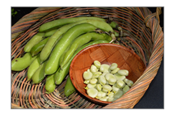
Jumbo Fava Bean fruit

Jumbo Fava Bean will grow to be about 4 feet tall at maturity, with a spread of 12 inches. When planted in rows, individual plants should be spaced approximately 12 inches apart. Because of its vigorous growth habit, it may require staking or supplemental support. This fast-growing vegetable plant is an annual, which means that it will grow for one season in your garden and then die after producing a crop. Because of its relatively short time to maturity, it lends itself to a series of successive plantings each staggered by a week or two; this will prolong the effective harvest period.