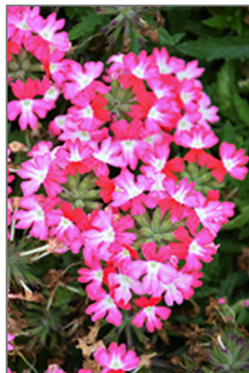
Hurricane Hot Pink Verbena flowers

Hurricane Hot Pink Verbena is recommended for the following landscape applications;