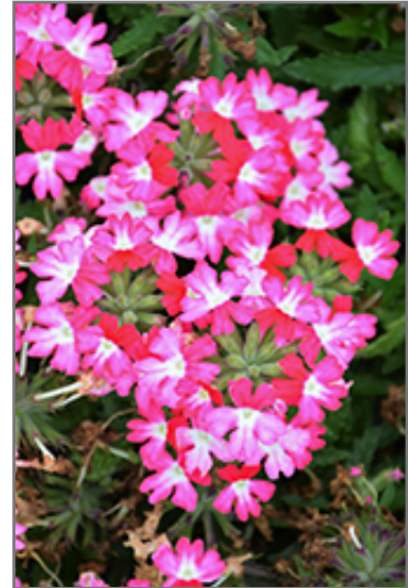
Hurricane Hot Pink Verbena flowers

Hurricane Hot Pink Verbena is recommended for the following landscape applications;