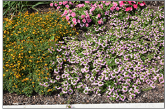
Surdiva Classic Pink Fan Flower flowers

Surdiva Classic Pink Fan Flower will grow to be about 10 inches tall at maturity, with a spread of 24 inches. When grown in masses or used as a bedding plant, individual plants should be spaced approximately 18 inches apart. Its foliage tends to remain low and dense right to the ground. This fast-growing annual will normally live for one full growing season, needing replacement the following year.